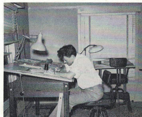
Art Shop — Open for Business!