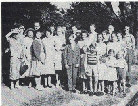
Australian brethren as of April 15.

The PLAIN TRUTH list is booming ahead too. There are fully 10,000 subscriptions! This is equal to that of Great Britain after seven long years of hard work in Europe. This is the result of six-night-a-week broadcasting! New subscriptions are flowing thick and fast — and expected to reach 15,000 by July.