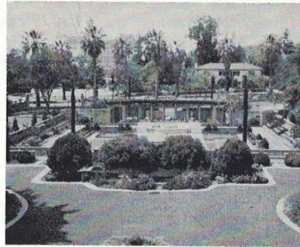
Future location of the fabulous fountain gardens.